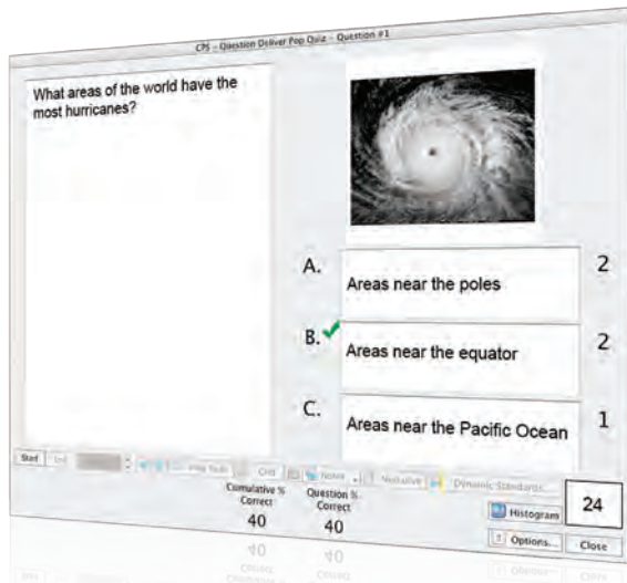
ExamView® Learning Series Content

The only student response systems that is ExamView® certified.