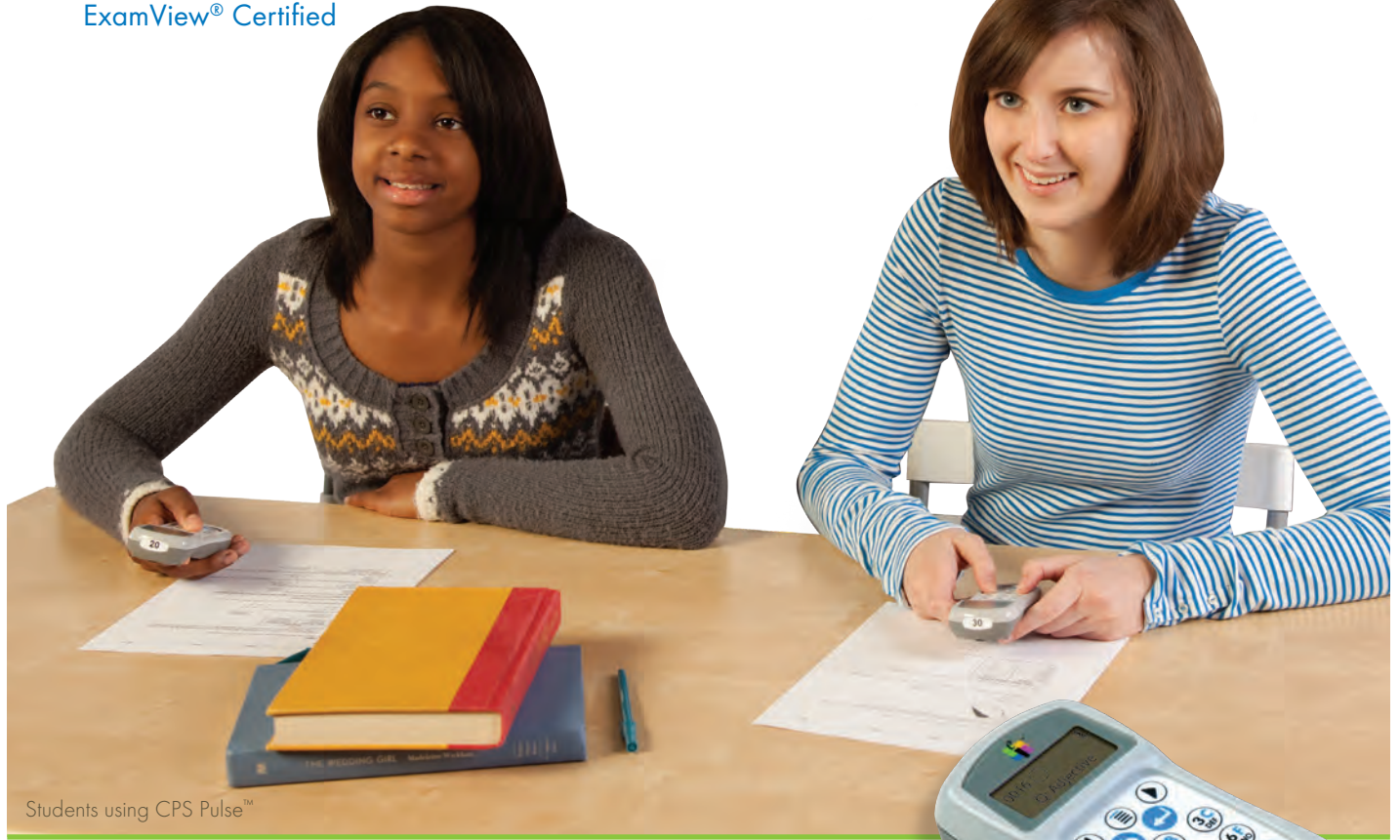
Students using CPS Pulse™